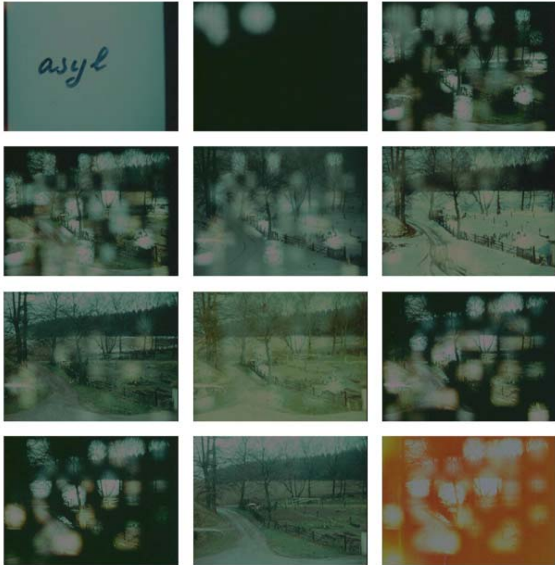
Abbildungen: Aus "31/75 Asyl" von Kurt Kren

dynamic relationship in my video. Every 'gap' is variously illuminated, through which the temporal order thereof can be distinguished only partially. Whether the pictures are of the past or the present is not determinable. The observer is required to supplement the missing information with the given features. "Zu den Zeiten", consequently, represents the Freudian characteristics of the unconscious: the pictorial representation, the primary process of condensation and novel arrangement of temporality and themes.