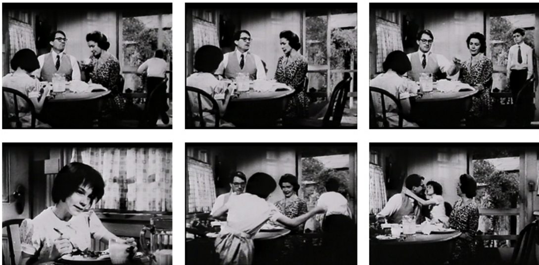
Abbildungen: Aus "Passage à l'acte" von Martin Arnold

One can encounter repetition in Psychoanalysis twofold: on one side, it compels, under the influence of the unconscious, the subject to wrong actions, such as taking detours during a walk. The relationship of the perception to primary function of condensation is rhythmically organized. However, there is repetitive movement in therapy, where the symptom can be acted against through a repetitive movement. The film techniques of "Zu den Zeiten" rely on those structures of the psychoanalytic methodology as well as the constitution of desire. Consequently, there emerges a justified comparable view between film and theory.